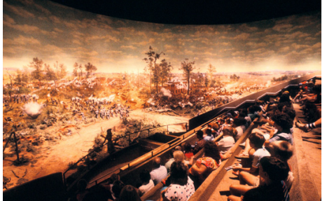
Atlanta Cyclorama and Civil War Museum