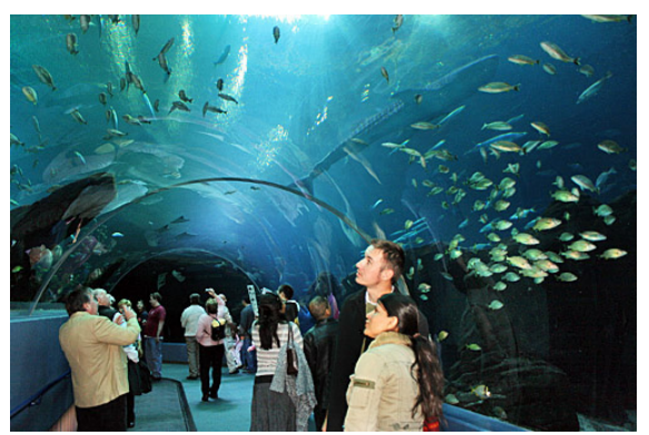
Opened in 2005, the Georgia Aquarium is the world's largest with more than 10 million gallons of water. It is the only aquarium outside of Asia to house whale sharks, the world's largest fish. It is also the only aquarium in the US to house manta rays.

Hour long guided tours at the CNN Center provide information on the different studio sets, how reports are found, edited, added to the promters, and delivered to you.