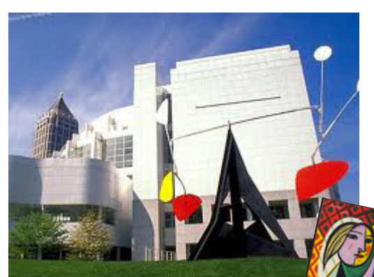
The High Museum of Art holds more than 11,000 works of art in its permanent collection.

Exhibit during Conference: "Picasso to Warhol - 12 Modern Masters"