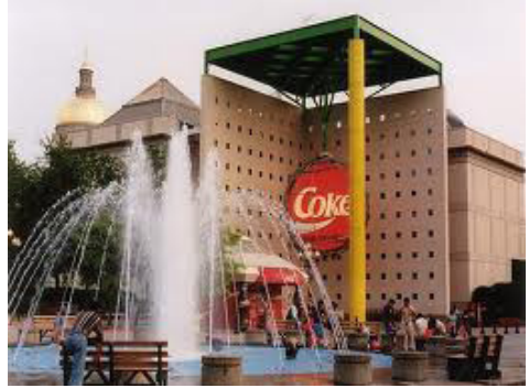
The World of Coca-Cola has a 4-D theater, the world's largest collection of Coca-Cola memorabillia, and a tasting experience with over 60 different products to sample, yum!

The NAC's Annual Meeting will be held in Atlanta this year! This world-class, modern city with a rich passionate history will leave you wanting more. From the 21 acre Centennial Olympus Park to the High Museum of Art, Atlanta has something for everyone. And don't miss out on the Aquarium and Botanical Garden tours on Friday, as these are undoubtedly some of the highlights that Atlanta has to offer. Below are some general attraction suggestions, but we recommend that you take the city into your own hands and experience as much as possible!