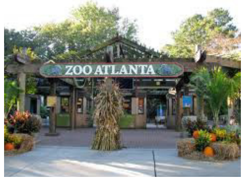
The Zoo Atlanta was founded in 1889, and is home to the nation's largest collection of gorillas and orangutans, as well as one of the only four zoos in the U.S. currently housing giant pandas!