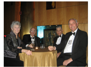
Some highlights from NYC!