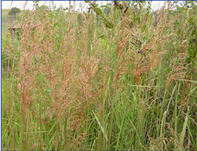
Tallgrass Prairie Reserve