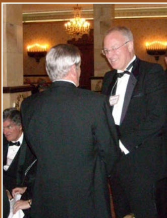
NAC members enjoyed sharing stories with one another during the meeting.