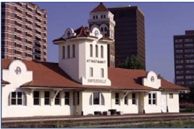
Train Depot: Bartlesville Chamber of Commerce

The NAC Bulletin is a publication of the National Academy of Construction.