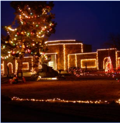
Woolaroc Museum, Wonderland of Lights