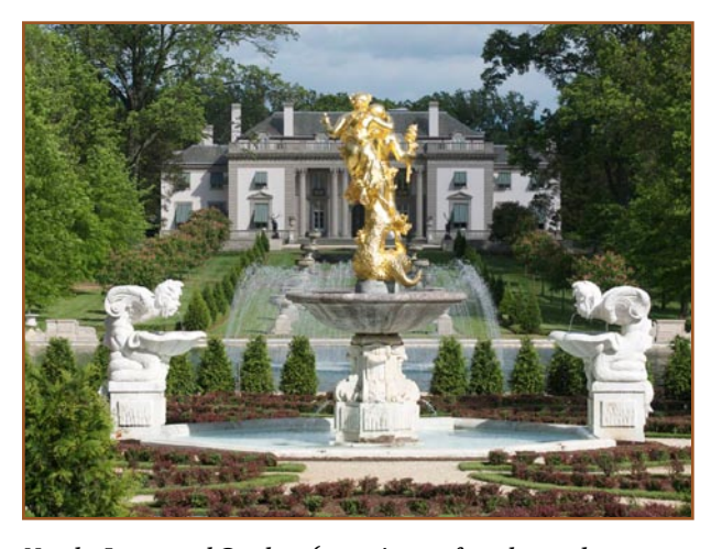
Nearby Longwood Gardens (sometimes referred to as the DuPont Gardens) was created by industrialist Pierre S. du Pont. Exquisite flowers, majestic trees, dazzling fountains, extravagant conservatories, starlit theatre, thunderous organ—all describe the magic of Longwood Gardens, a horticultural showstopper where the gardening arts are encased in classic forms and enhanced by modern technology.