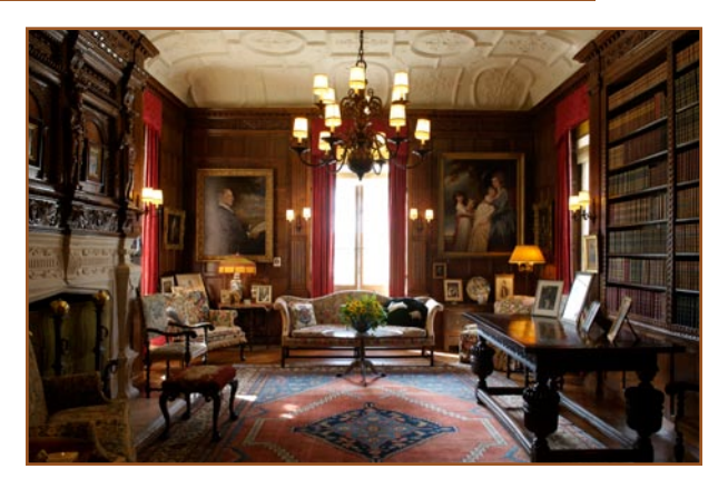
Winterthur Museum and Country Estate is the former home of Henry Francis du Pont, who amassed the world's premier collection of American antiques. This collection is on display inside the 175-room mansion, which is open for themed tours Tuesday through Sunday.

Nemours is the 300-acre country estate of the late industrialist and philanthropist Alfred I. duPont. The mansion was built from 1909 to 1910 and is a fine example of a French chateau in the style of Louis XVIth. The 47,000 sq. ft. mansion looms over the surrounding formal gardens and is furnished with fine antiques, famous works of art, beautiful tapestries, and other treasures. The grounds surrounding the mansion extend for one third of a mile along the main vista from the house, and are among the finest examples of French-style gardens in the United States. Nemours re-opened in May 2008, following a $39 million renovation.