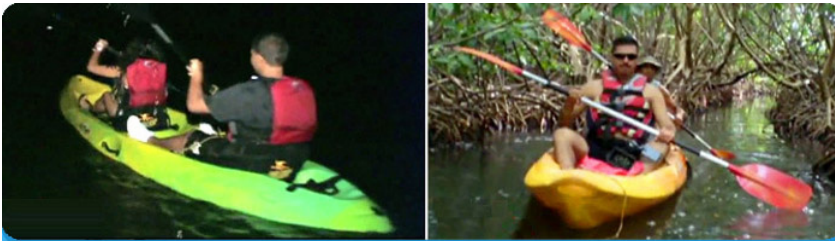
RST Vacation: Tours

Don't let your day end when the sun goes down! We offer relaxing kayak tours at sunset that lead to the fascinating lagoon at Las Cabezas de San Juan Reserve. Under the blanket of the night sky and the historical lighthouse of Fajardo, you can touch and swim the waters that glow with the bioluminescent organism. It's an unforgettable experience just available in 5 lagoons around the world and Puerto Rico holds 3 of them. Come and join us for a trip that will leave you breathless! Price: $98 per person Duration: 4 hours