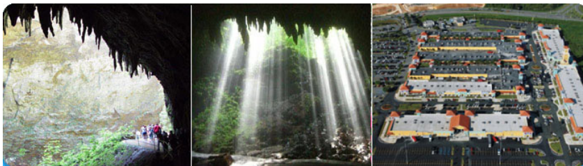
RST Vacation: Tours

Embark on an underground adventure at the Camuy River Cave Park , featuring a spectacular array of caverns securely adapted for visitors. Located in the northern area of the island, the caverns were formed by the flow of the Camuy River over one million years ago. Is one of the largest systems of caverns united in the Western Hemisphere. The excursion will take you through caverns holding enormous stalactites and stalagmites. The Camuy River, which runs through the cavern's interior, is also believed to be one of the most spectacular underground rivers in the world. Then shop at Prime Outlets and obtain great deals! We suggest having lunch at the food court. Price: $110 per person Duration: 8 hours