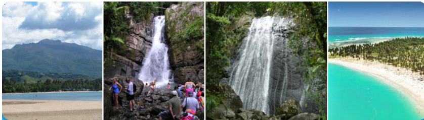
RST Vacation: Tours

Two Fascinating Views. Combine the morning trip to El Yunque with an afternoon of swimming, sun tanning and relaxing on placid Luquillo Beach. The soft sands, shaded by imposing coconut palm trees and the azure waters of the Atlantic Ocean make it a dreamer's retreat. Lunch is not included, although we suggest you to sample the tasty local specialties such as seafood and Creole fritters from the kiosks at Luquillo Beach. Price: $74 per person Duration: 8 hours