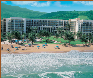
The Wyndham Rio Mar Beach Resort & Spa will host this years Annual Meeting!

The purpose of the Academy is to provide recognition to past and present industry leaders for their personal contributions to the engineering and construction industry.