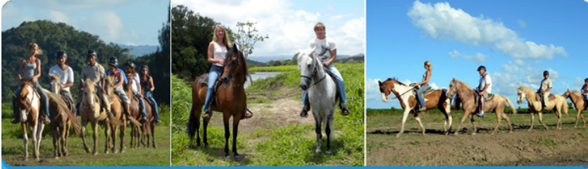
RST Vacation: Tours

Ride beautiful Paso Fino horses around 2,200 acres of Puerto Rico countryside in gentle, but spirited, healthy horses that can accommodate beginner, intermediate, and advanced riders. We start with basic lesson in horseback riding and safety orientation. Once mounted on the horse, the two hour excursion begins and traverses through table top ranges, around lakes, along subtropical forest. We take a short break at the halfway point to give the horses and guests a breather. And after the break, we ride back to the reception area taking in the sights and sounds of all the wildlife. Price: $95 per person Duration: 3.5 hours