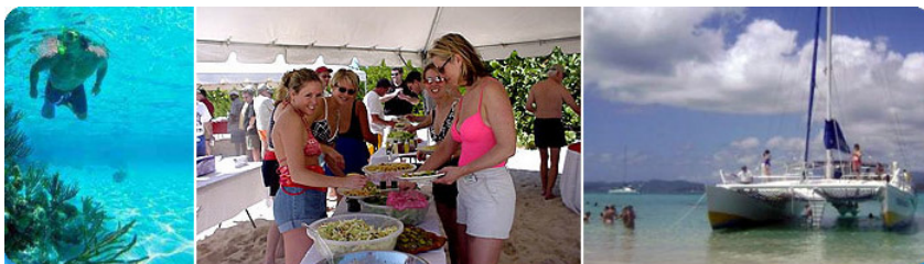
RST Vacation: Tours

A Feast Under the Sun. Sail, snorkel and picnic to a Paradise Island . Board a catamaran for a leisure sail to an uninhabited Island, where you can enjoy the crystal clear waters of the Caribbean, collect shells, sunbathe, wade or swim offshore. Complimentary lunch (buffet style with fruits, cold cuts and salads) and tropical drinks will be served. Non-swimmers as well as swimmers will take advantage of professional instructions in snorkeling to fully view the diverse ecology of the area. Equipment and transportation included. Have fun and relax! Price: $95 per person Duration: 7 hours