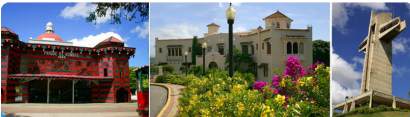
RST Vacation: Tours

Puerto Rico's Regal "Pearl of the South". The city of Ponce unveils an enchanting portrait of colonial history, art and culture. The architectural splendor and detailed neoclassic and art deco style of the city makes Ponce an essential part in your itinerary. The city's buildings such as the 19th century Fire Station and "La Perla" Theater, demonstrate more than 300 years of an elegant tradition that has made Ponce the center of Puerto Rico's southern economy. Major sites like the Serrallés Castle, former home of the island's oldest rum producing family and El Vigía Cross are part of the tour of Puerto Rico's second oldest and largest city. All admissions included. Price: $110 per person Duration: 8 hours