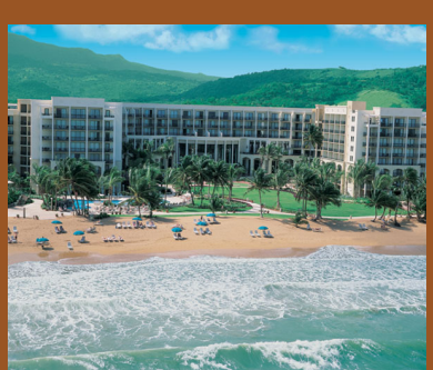
The Wyndham Rio Mar Beach Resort & Spa will host this years Annual Meeting!

The purpose of the Academy is to provide recognition to past and present industry leaders for their personal contributions to the engineering and construction industry.