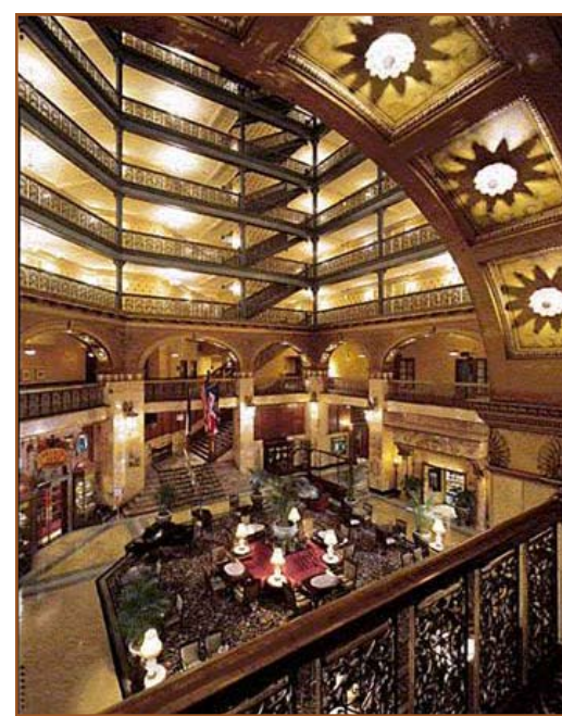
Brown Palace Hotel, Lobby and Atrium