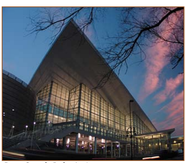
Denver Center for Performing Arts