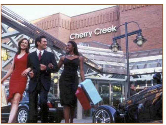
Cherry Creek Shopping Center