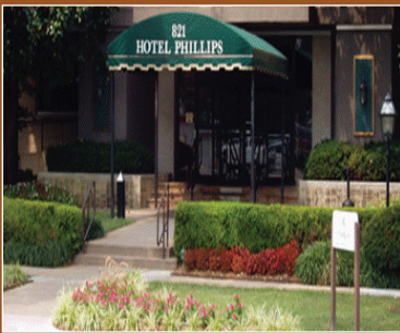
The Hotel Phillips is the host hotel for our annual meeting.

The purpose of the Academy is to provide recognition to past and present industry leaders for their personal contributions to the engineering and construction industry.