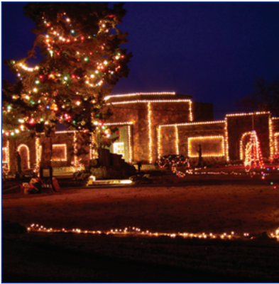
Woolaroc Museum, Wonderland of Lights